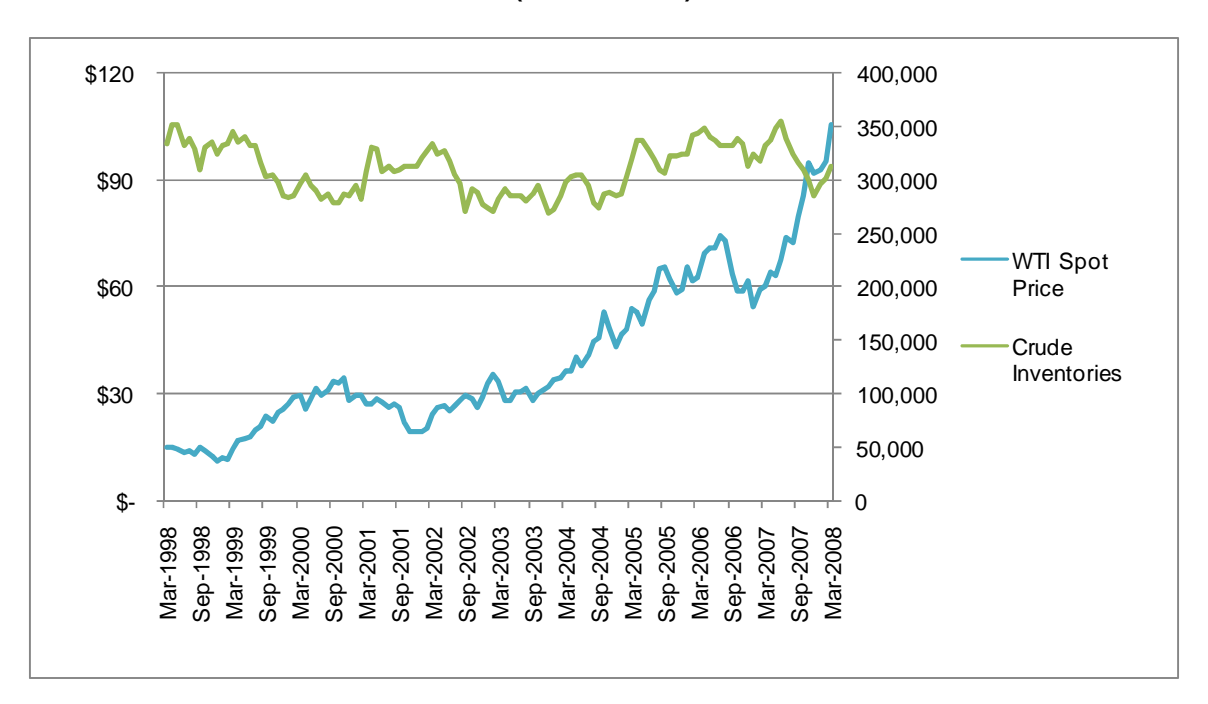
Figure 1 West Texas International Crude Oil Spot Price versus U.S. Commercial Crude Inventories (monthly, thousands bbls) (source: EIA<sup>iv</sup>)

In contrast to Figure 1, we can instead look at the historical relationship between home prices and rental housing vacancy rates during the recent boom. As Figure 2 below illustrates, there is a compelling connection between the two, which confirms the theory that speculators bought homes in the early to mid-2000s not to live in or even to rent out immediately, but rather as investments to capture future price appreciation.